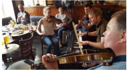
Photo: Sunday morning impromptu session at the Royal Hotel