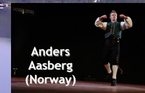
Eurovision 2009 winner