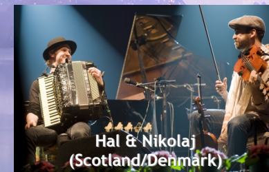
Danish Folk Awards 2009 winners